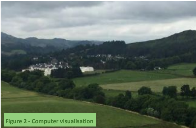
Figure 2 - Computer visualisation

The “illustrative master plan” shows a layout of 62 housing units, of which 20 would be designated “affordable”. The layout is the same as shown in the pre-application consultation, while the “Design Statement” provides some more detail of house types and proposed landscape setting.